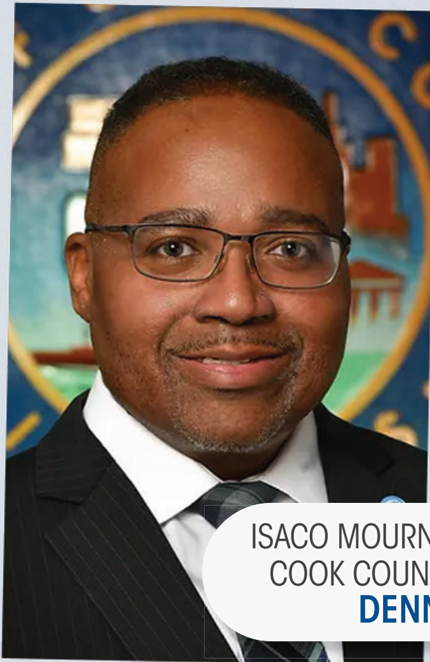
ISACO MOURNS THE PASSING OF COOK COUNTY COMMISSIONER DENNIS DEER

RECAP OF NACo's 2024 ANNUAL CONFERENCE & EXPO