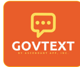
Ascendant App, Inc.